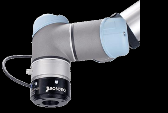
Image credits RealSense Camera, Intel Robotiq Force Torque Sensor, Universal Robots